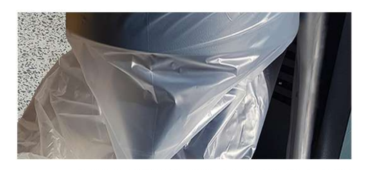
DROP DOWN CONTINUOUS BAGS