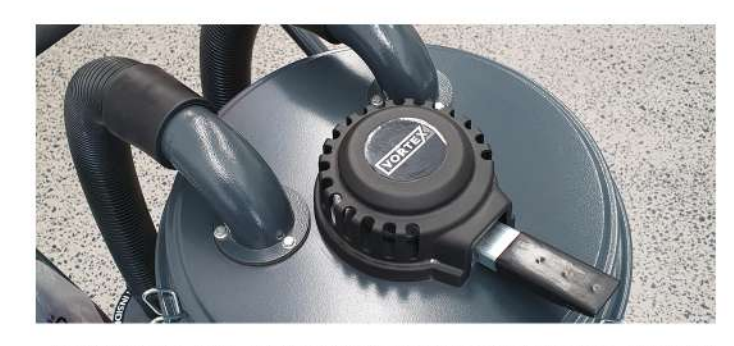
UNIQUE CLEANING WITHOUT OPENING VACUUM