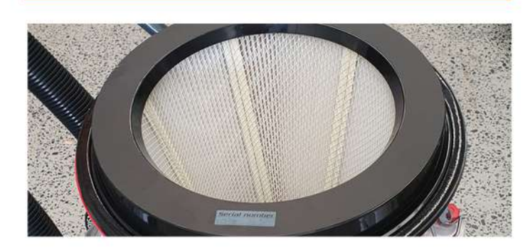
TESTED & CERTIFIED CLASS H HEPA FILTERS